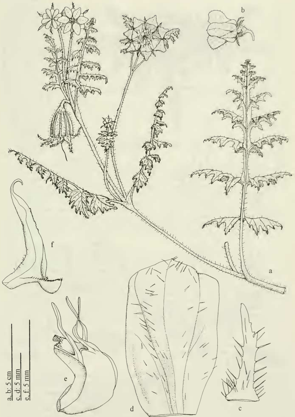
Fig. 3: Cajophora chuquitensis , cult. at Munich: a habit; b flower; c sepal; d petal; e floral scale, lateral; f staminode.